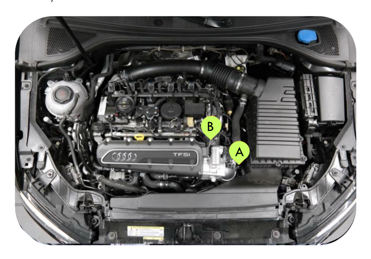
Step 3 – Wiring Harness Installation: Lay wiring harness over engine bay and route the labelled harness sections to there respective connection points, using Step 2's images for reference.

Turbo Boost Pressure Sensor = A / Manifold Absolute Pressure Sensor = B